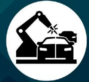
Automobile / Industrial