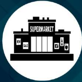
Supermarket & Hypermarket