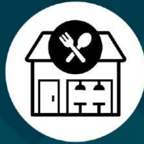
Restaurants & Cafe