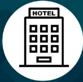
Hotels & Apartments