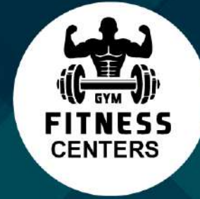
Gym and Fitness Centers