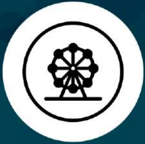
Entertainment & Public Parks