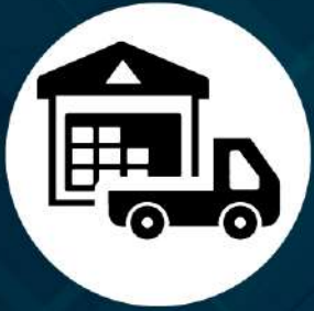
Warehouses / Logistics