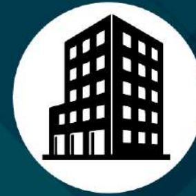
Business Center & Corporate Offices