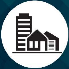
Residential / Commercial Buildings